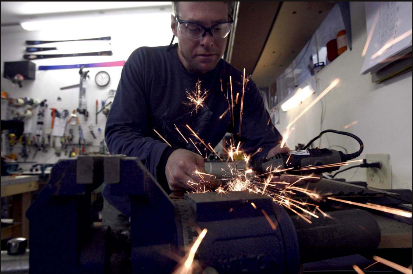
Sparks fly at the Wagner Custom shop for another pair of custom-tailored skis

Wagner is on the cutting edge of ski design and it is available to you.