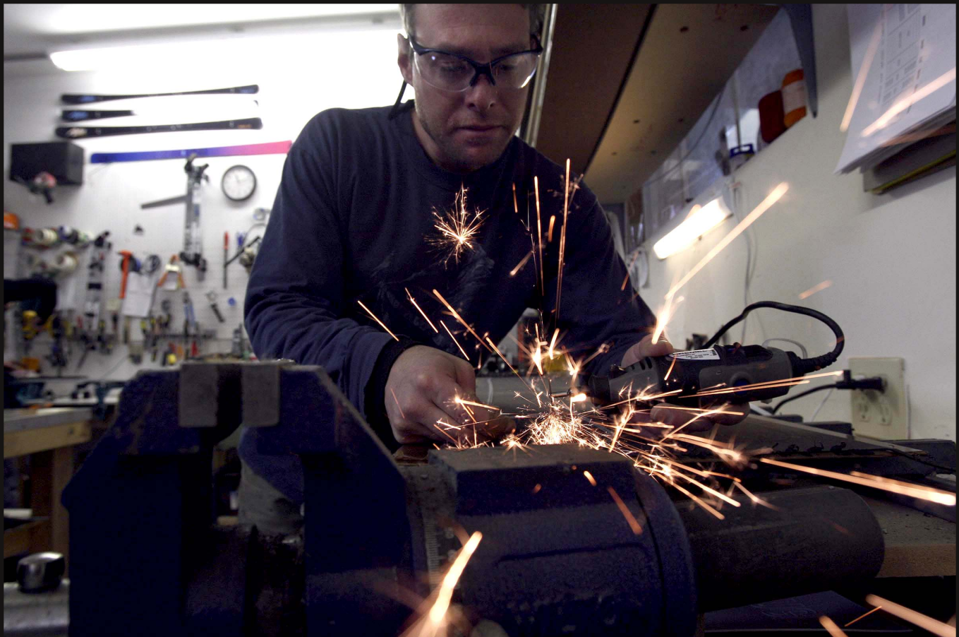
Sparks fly at the Wagner Custom shop for another pair of custom-tailored skis

Wagner is on the cutting edge of ski design and it is available to you.