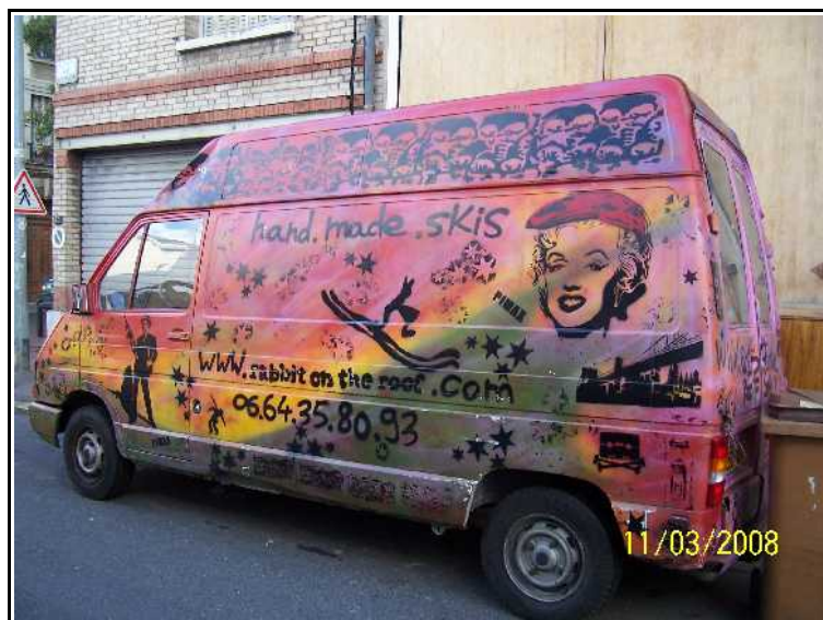
The Rabbitmobile outside the shop

thought I was a vegetarian.” - his agile features reveal a bit of a rule breaker - like the guy in highschool who skipped classes, but whose charm and exceptional work got him the magic “get-out-of-jail-free” card.