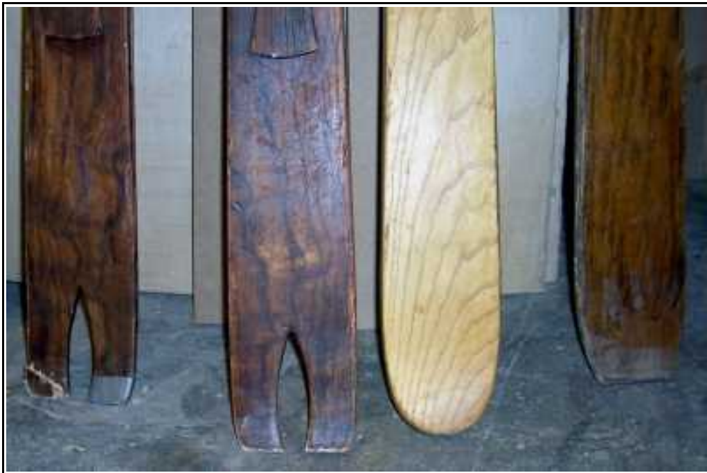
Some tail designs (broken one happened in Chile, I think... "repairable" says Peter. (You can see the tail end of the binding mount segment above the split-tail))