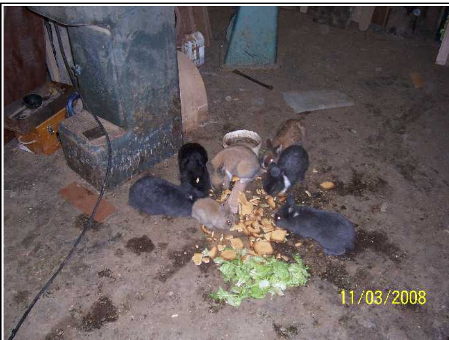
The rabbits eat Peter out of house and home, but are pretty fun to have in the shop.