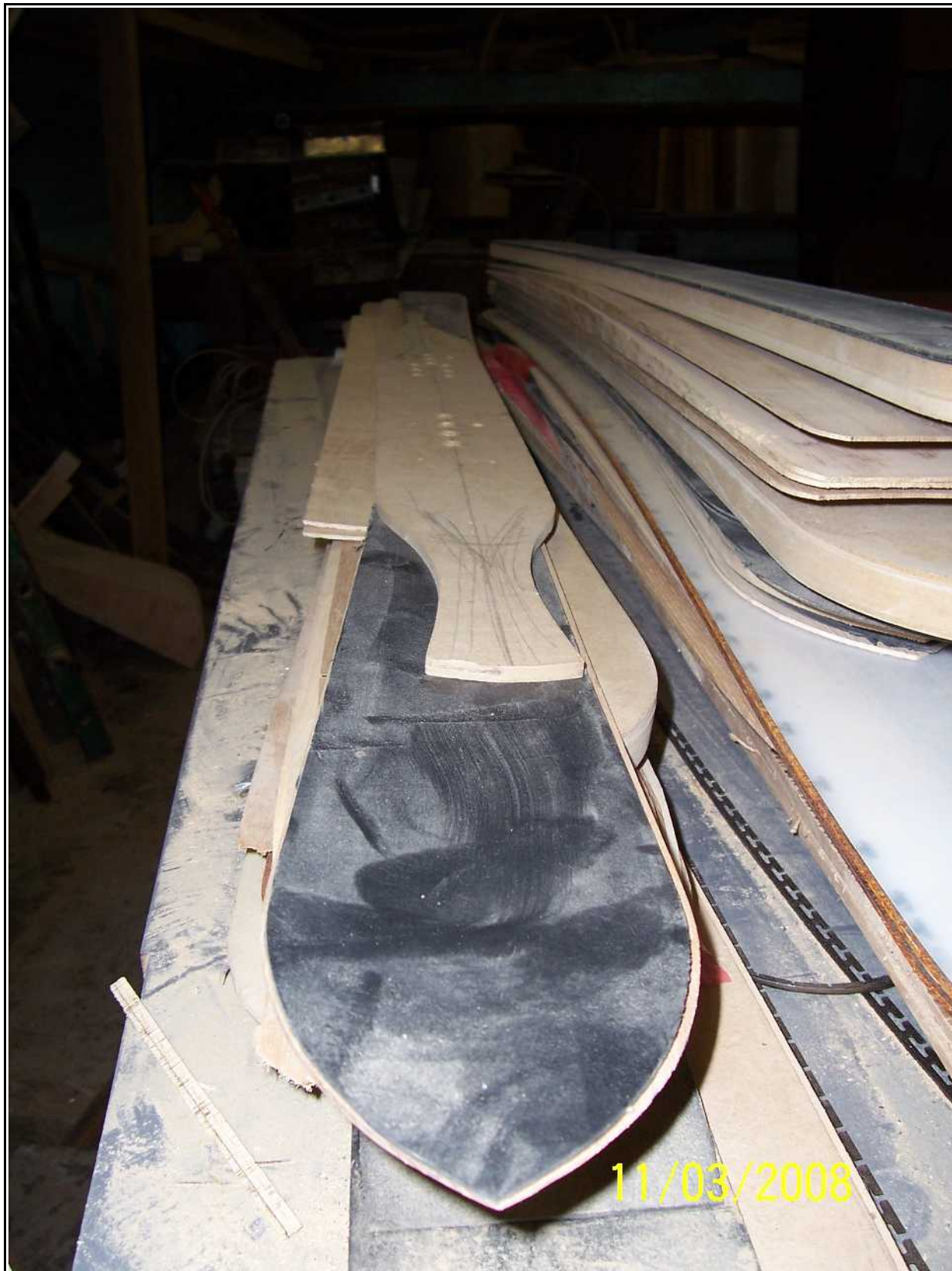
The pieces of Rabbit On The Roof Skis