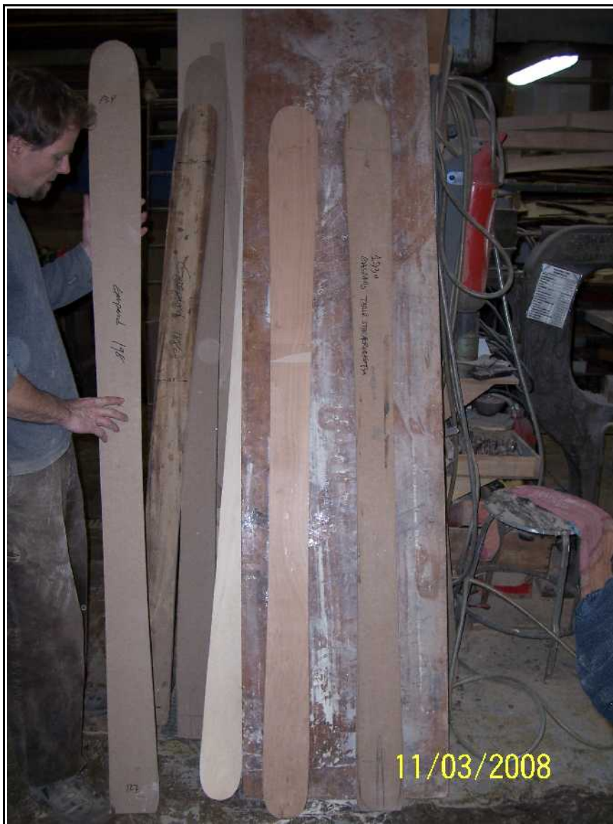
The patterns are everywhere!