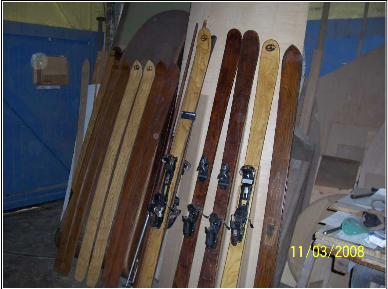
Quiver sample from Rabbit On The Roof