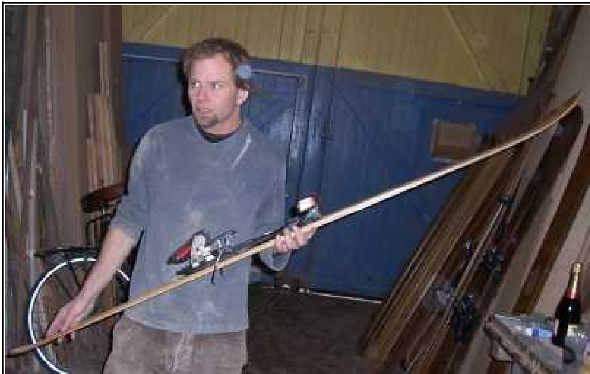
Check out the profile thickness along the ski tip to tail....