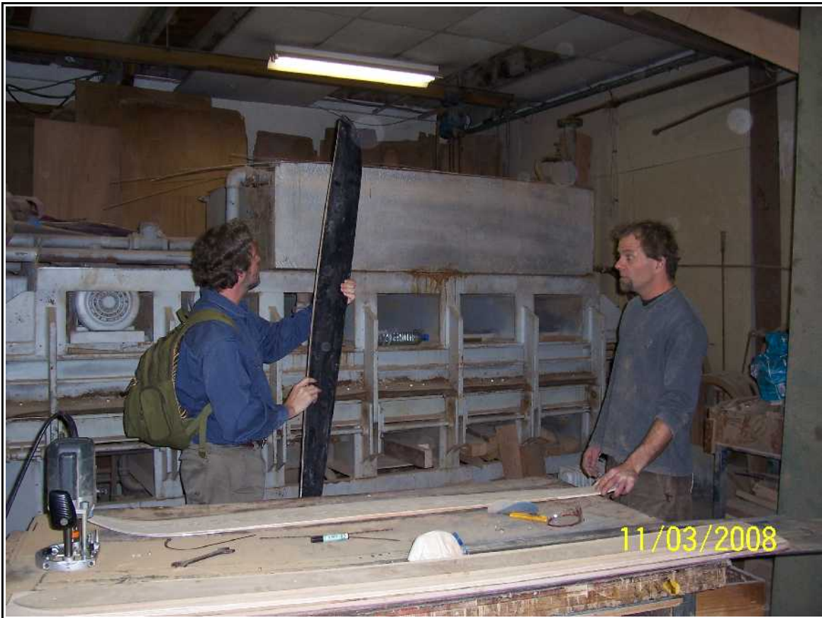
Checking out the waterski-shape experimental skis (note the pintail)