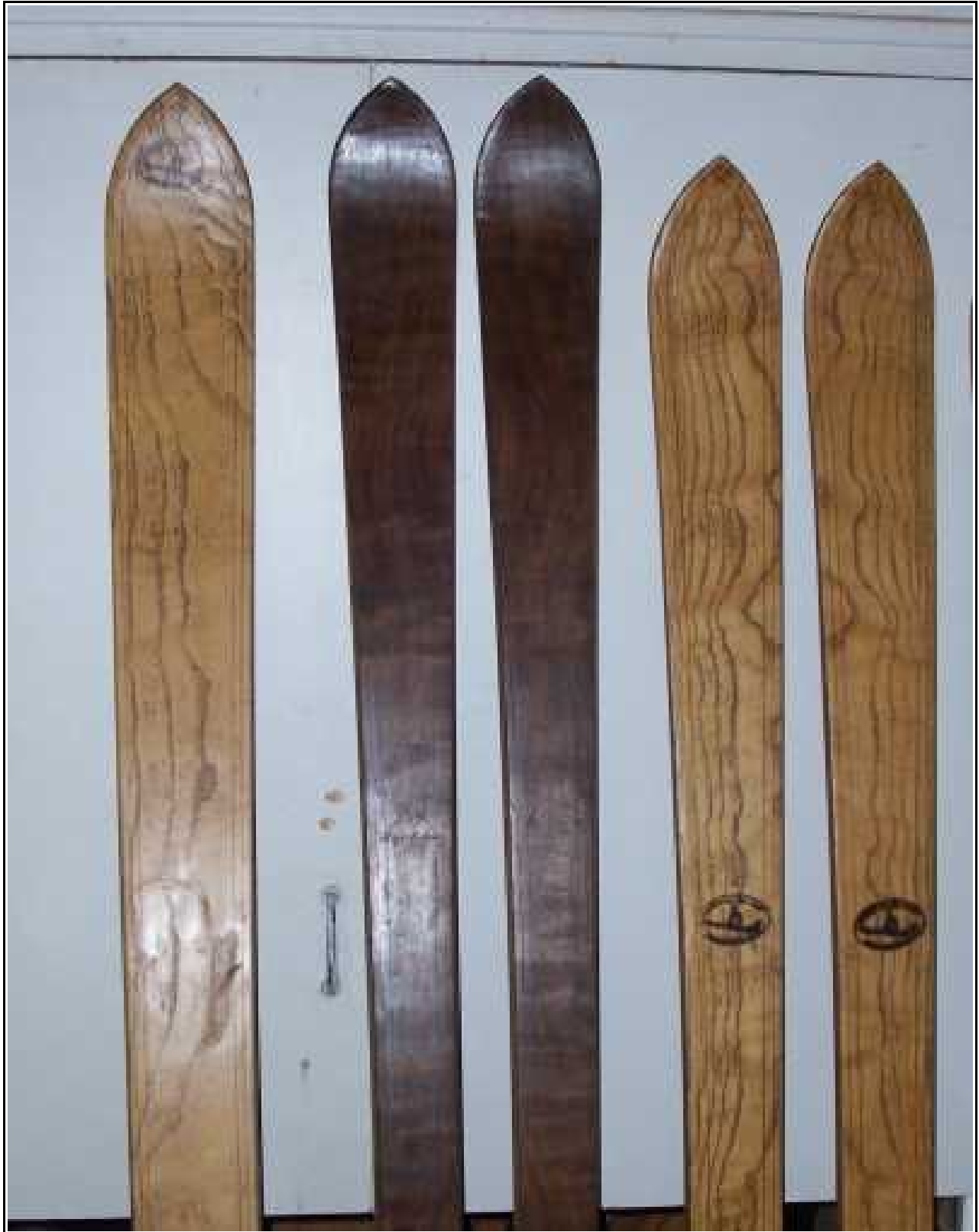
Shapes for all kinds of terrain