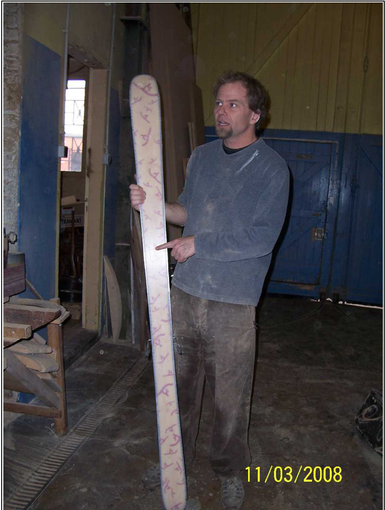
Note the long taper on the forebody and the cool base graphics