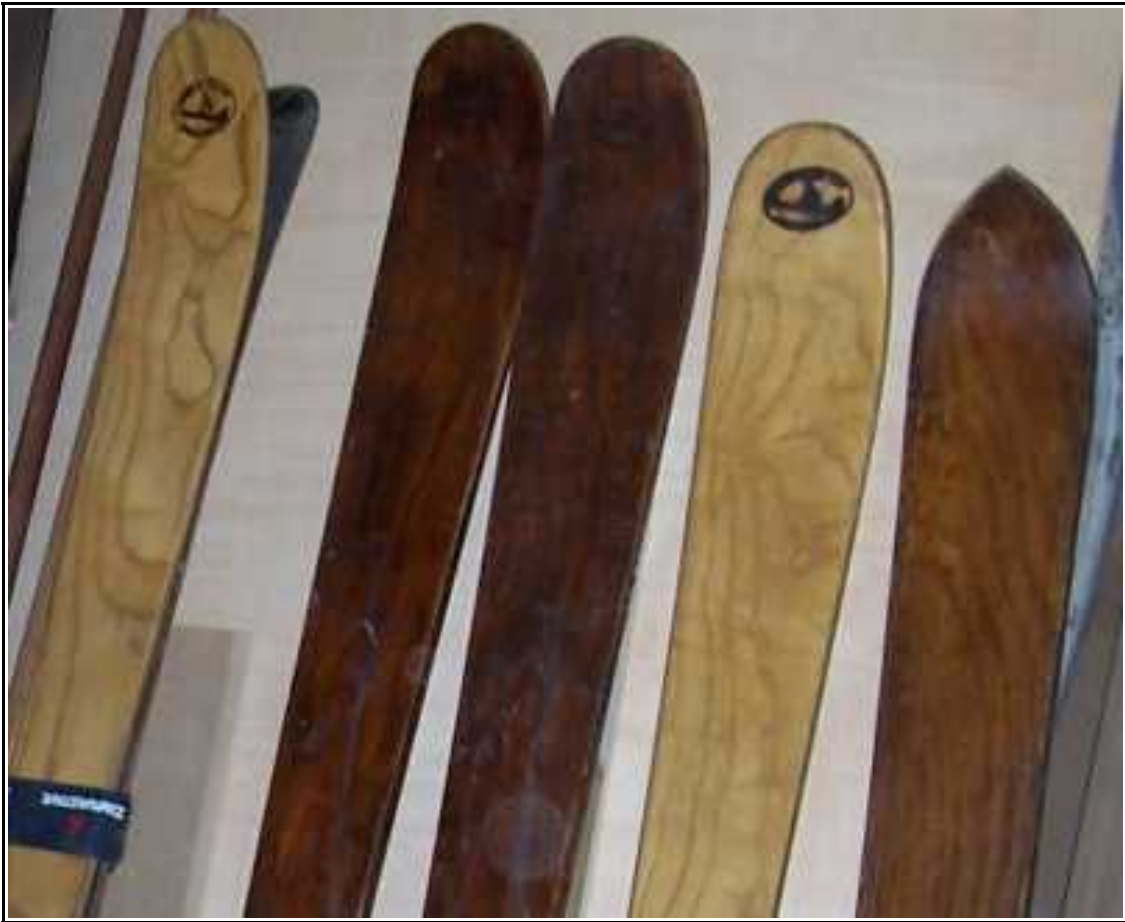
Tip shapes as you want them....