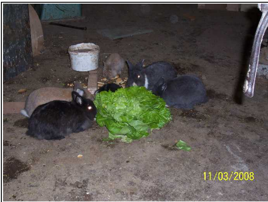
Real Rabbits = Real Skis

last century, and working with it I wanted to have a production I enjoyed, especially because Parisan life is stressful and far too far from the mountains. I thought of the beautiful old skis we so often see on the walls of our favorite mountain spots and thought to make a modern,competitive, performant ski with the same