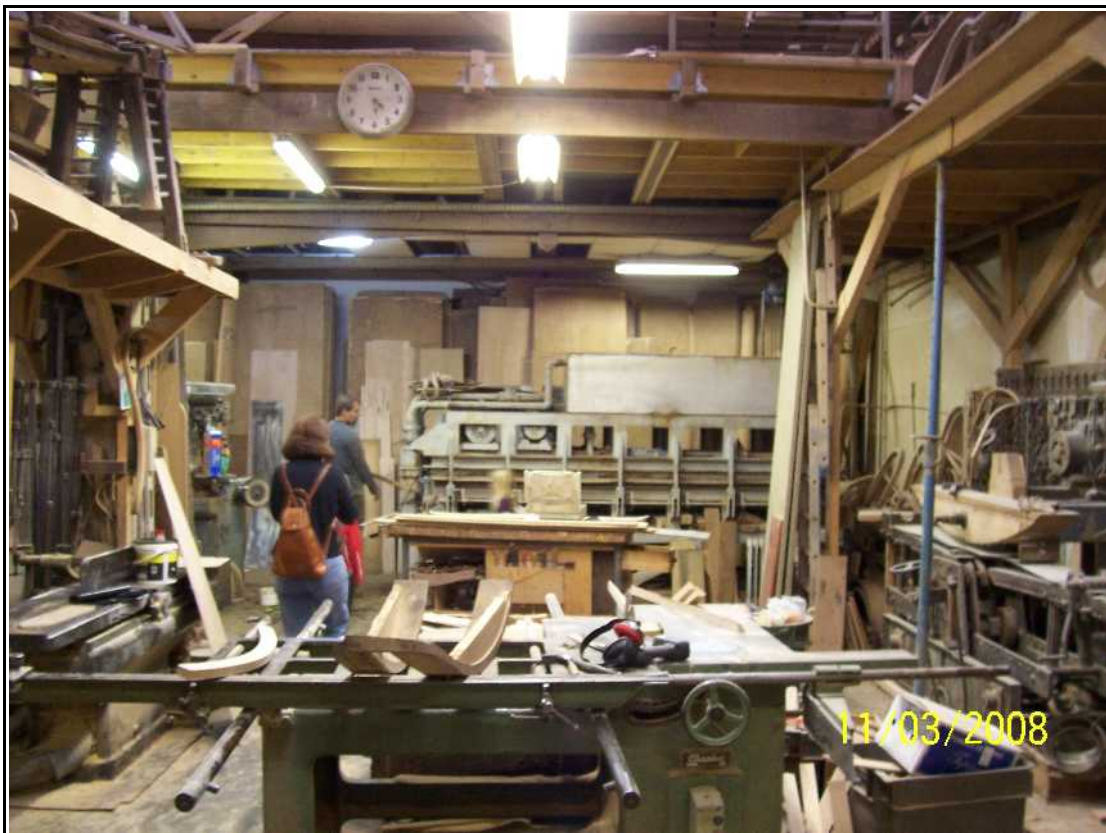
Rabbit on the Roof Skis "Made Here"