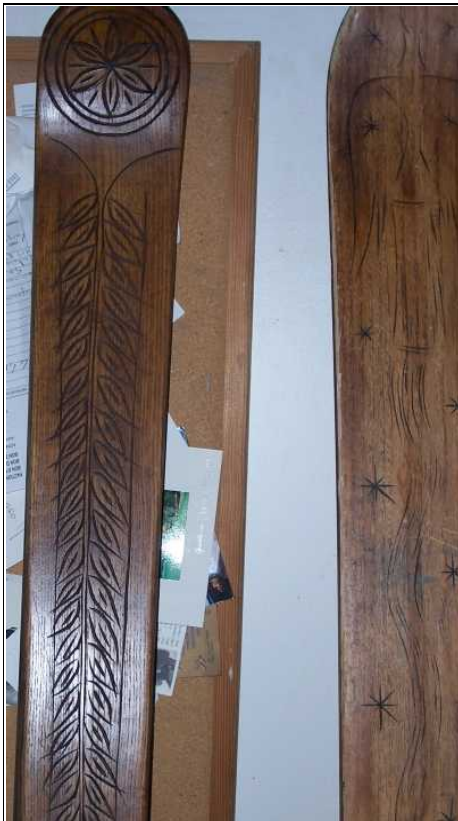
Leaves and Snow Ghost engravings