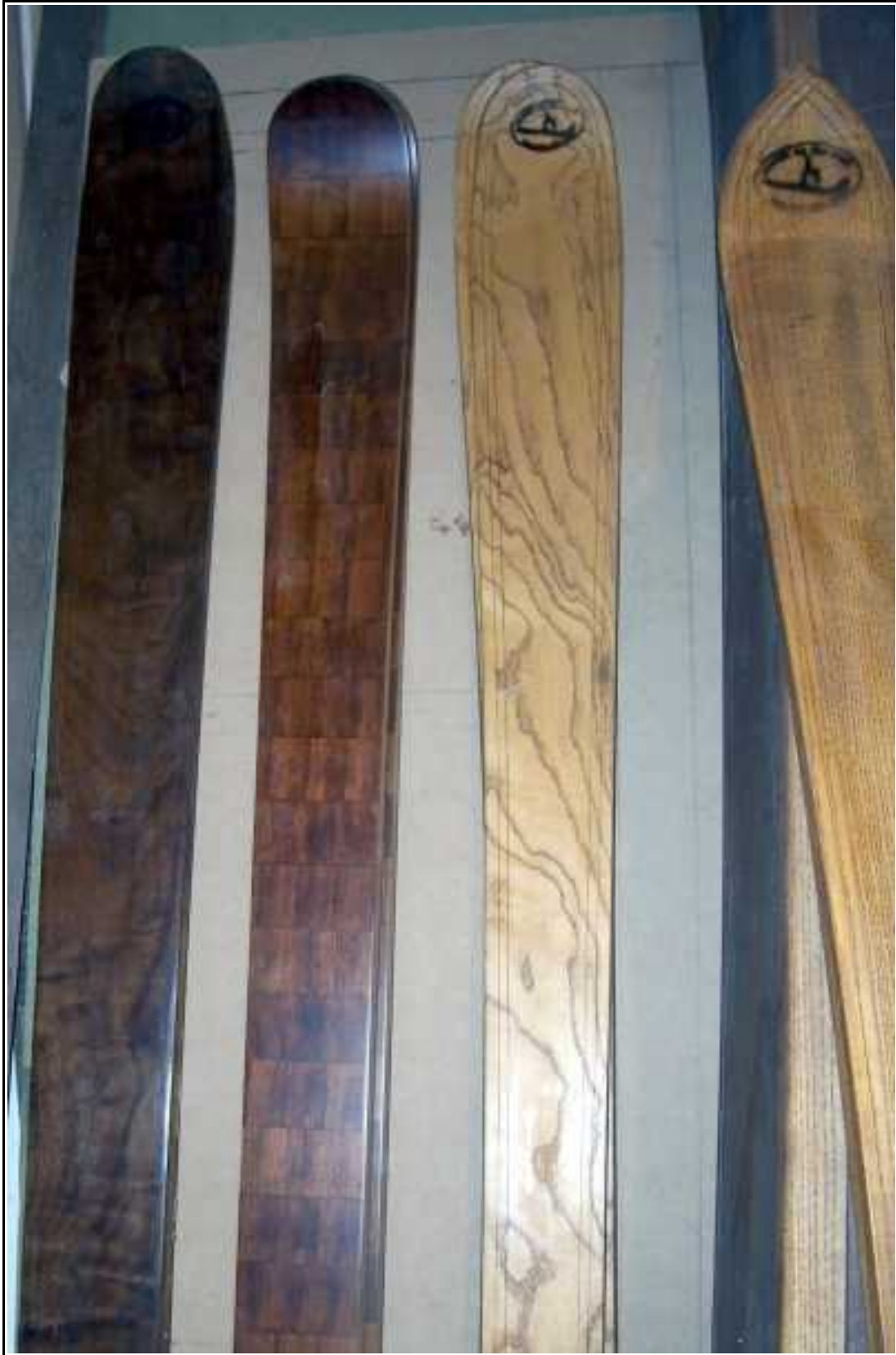
Some examples of Peter's different topsheets and shapes.