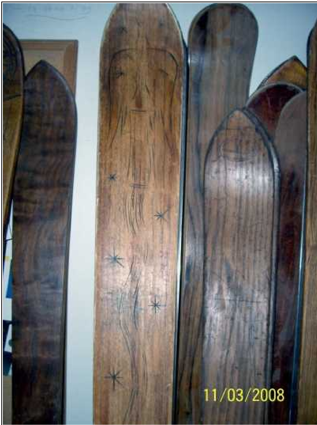
Snow Ghost and buddies